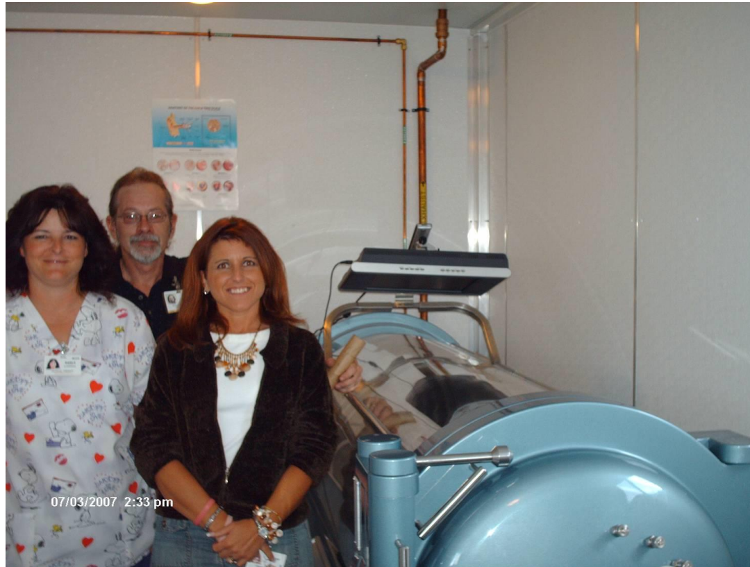
Chamber shown is a Sechrist 2500B chamber equipped with RSI chamber TV system.