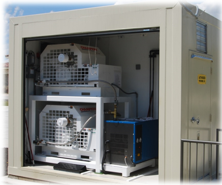
Champion Oil-less Air Compressors and Air Dryer