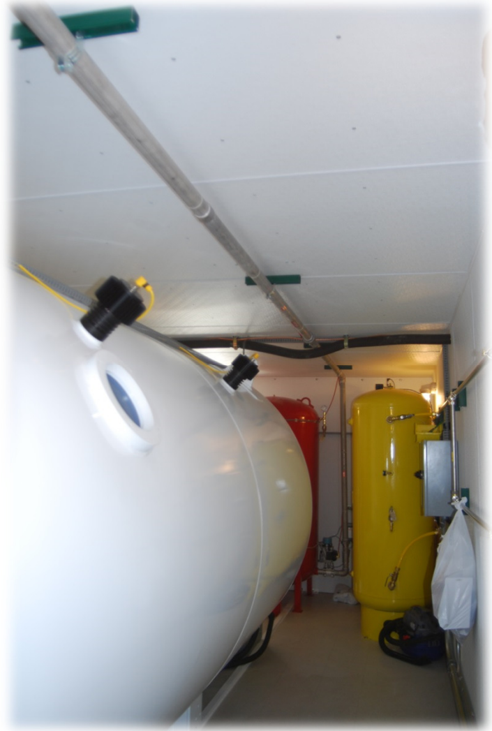
Partial views of FSS Deluge water tank with actuation controls, Air Accumulator (only one seen in this picture) and exterior view of the chamber with lights