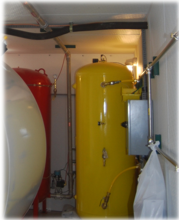
Air Accumulator (comes with two air accumulators, each rated for 400 gallons, only one seen in this picture, other one hiding behind it)